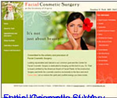
Facial Cosmetic Surgery