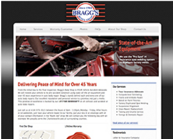
Bragg's Body Shop, Charlottesville VA