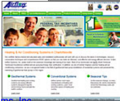
Airflow Systems, Inc