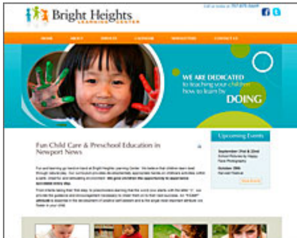
Bright Heights Learning Center, Newport News VA