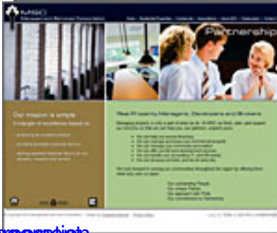
NSC of VA Corporation