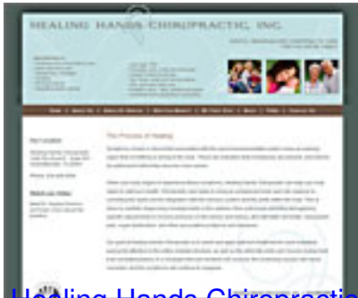
Healing Hands Chiropractic