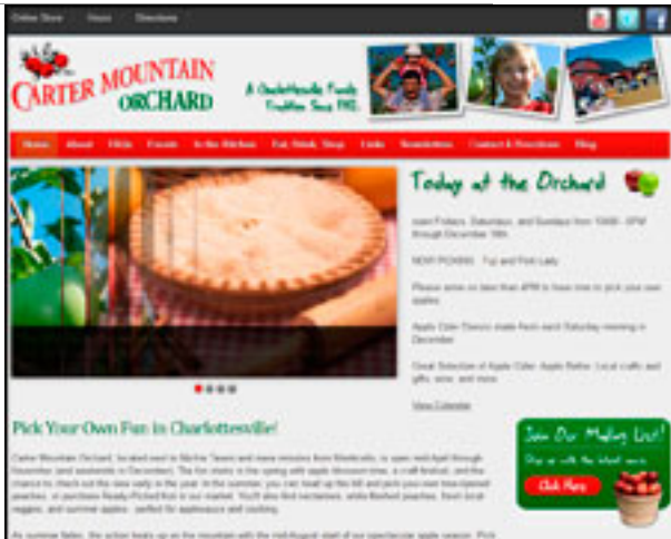
Carter Mountain Orchard, Charlottesville VA