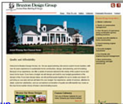
Braxton Design Group