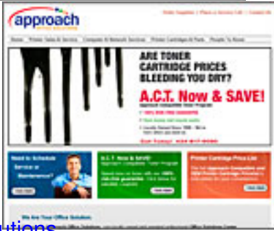
Approach Office Solutions