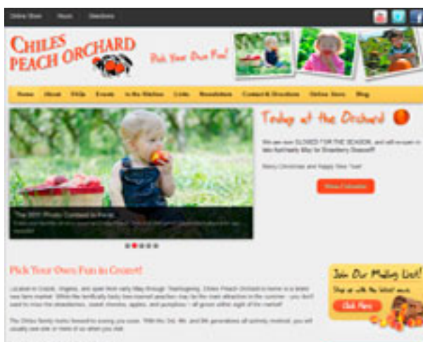
Chiles Peach Orchard, Charlottesville VA

Project: Carter Mountain wanted a new layout that would be inviting and function. We built them a new website using Joomla for content management. We also implemented a new recipe management system and photo submission system.