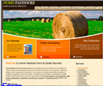
Blamp; Estate Services