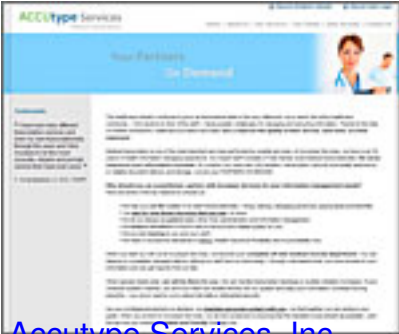
Accutype Services, Inc.